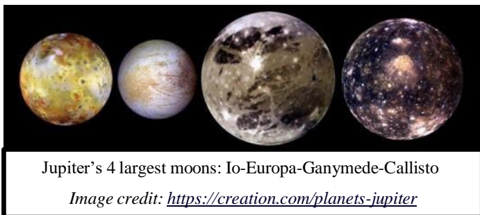
Jupiter's 4 largest moons: Io-Europa-Ganymede-Callisto

As fascinating as its beautifully colored cloud layers and storms are, Jupiter's moons are equally fascinating. You would think all moons around other planets would be rocky bodies like our moon. The truth is, God took pleasure to design them with great variety. Even Calisto, which is rocky, and the most heavily cratered in the solar system, shows signs of a young age. Whereas Europa has the smoothest surface in the solar system, a shell of ice. Io is covered with active volcanos and puts out two times more heat than it receives from the sun; big signs of its youth.